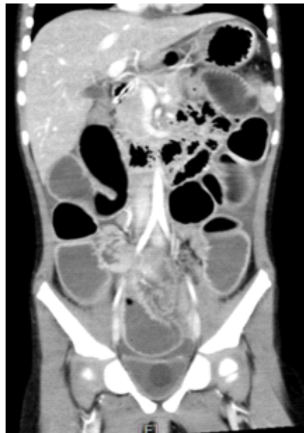
Figure 2. CT scan of the abdomen demonstrated multiple dilations of small bowel.