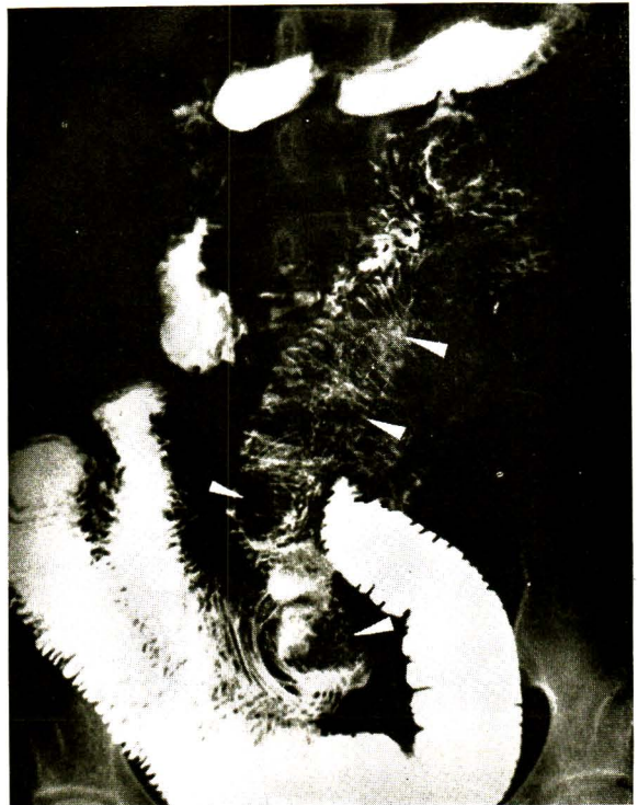
Fig 2. Small bowel series at 60 minutes demonstrating incomplete obstruction. The narrow central canal of the intussusceptum with longitudinal folds is seen (upper two arrows). Coil spring pattern of intussuscipt is seen. Leading masses are seen (lower two arrows).