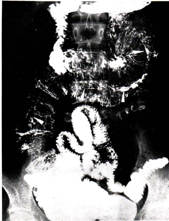
Fig. 3 Later films at 90 minutes demonstrating longer segment of the intussusception. Longer central canal (arrows) as well as coil spring pattern of intussuscipts. are noted