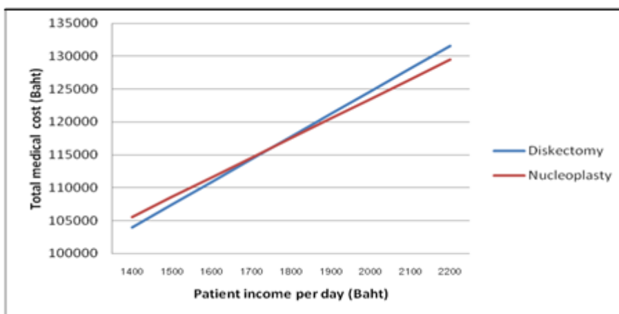
Figure 3. Sensitivity analysis : patient’s income per day and total medical cost.