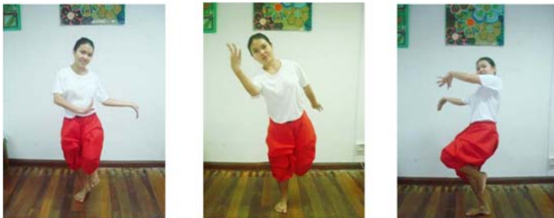
Figure 1. Type of Thai dance.

The poses used in the Thai standard circle dances consist of raising-lowering-bending-stretching arms, raising left and right arms alternately, raising and lowering legs, bending and stretching the knees, standing on toes and full feet, turning left-right, and turning around oneself (Figure 1).