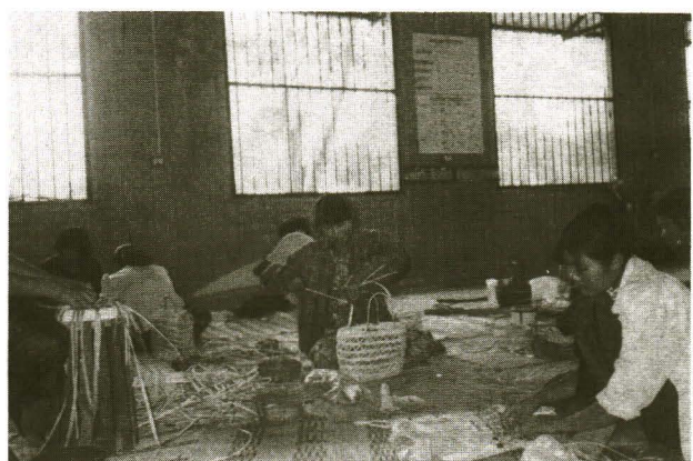
Training in handcrafts

Simultaneously with the training in crafts, the nursing researchers set up an innovative way to improve the nutritional status of all the villagers, thus improving the status of women who were pregnant or breast feeding and children under age 5. The researchers demonstrated healthful, nourishing meals based on foods that could be obtained locally or foods that had been dried, such as pork, that could be transported to the village without spoiling. Women, men and teens in the village gave return demonstrations of meal preparation and learned how to cook nutritious meals based on the basic food groups.