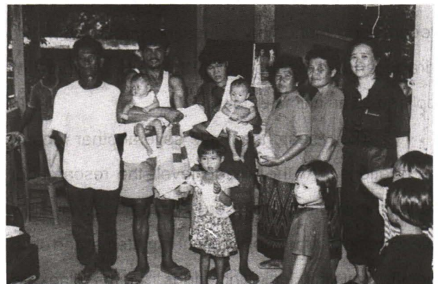
Assessment of malnutrition