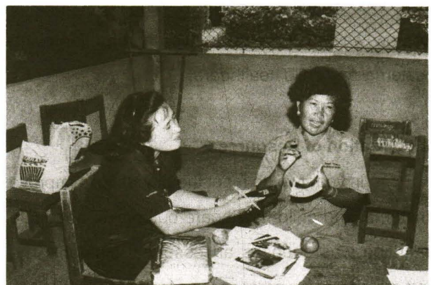
Training in hand-weaving