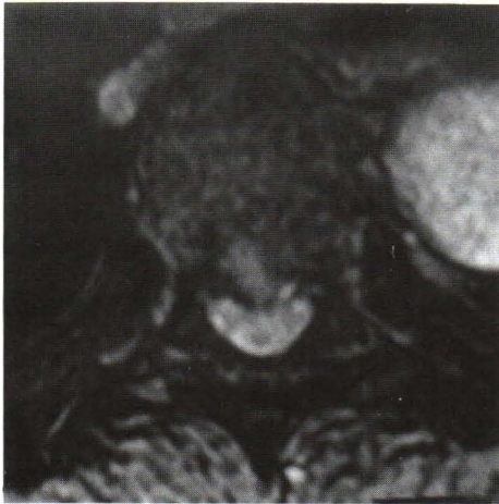
Figure 1. Axial MRI of a soft thoracic disc.