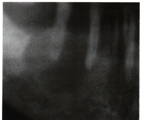
Figure 1. Shows a large radiolucency area, well defined margin (after extraction of the right lower 1 st premolar) involved Mental canal.

3 rd visit (the 13 th days = the day of operation) : The result of the biopsy was a fragment of granulation tissue of premolar area. During this visit we undertook