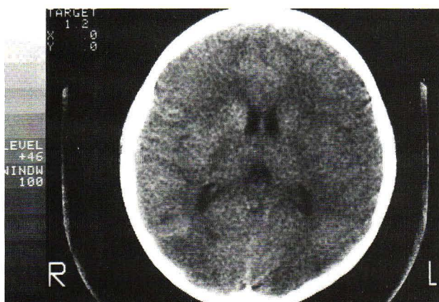
Figure 1. Unenhanced CT scan of case III shows decreased attenuation in parieto-occipital lobes bilaterally.

diazepam (0.25 mg/kg) to control the convulsions. She was placed on a respirator for ventilation support. Sodium nitroprusside infusion was started. Two small doses of mannitol (0.25 gm/kg) were given 14 hours apart. She gained consciousness one and a half hours after the first dose of mannitol (8 hours after admission). Her visual acuity improved and she was able to read 48 hours after admission. Thirteen days later her visual acuity were 20/20 in the left eye and 20/30 in the right eye, and other eye examinations were unremarkable with the exception of a thickening of arteriolar walls. Investigation of retrospective values included : ASOT 1:156 (normal < 1:156); AntiDNase B. 1:400 (normal < 1 : 300); complement, CH 50 , 11 units/ml; sterile urine. Eighteen days later some of these values were ASOT, 1:195; AntiDNase B 1:200; complement CH 50 , <10 units/ml and C 3 <40 mg/dl. She lost 4 kilograms in weight during admission. Her blood pressure was normalized within 12 days. She made full recovery and her urine became normal 2 weeks after the onset.