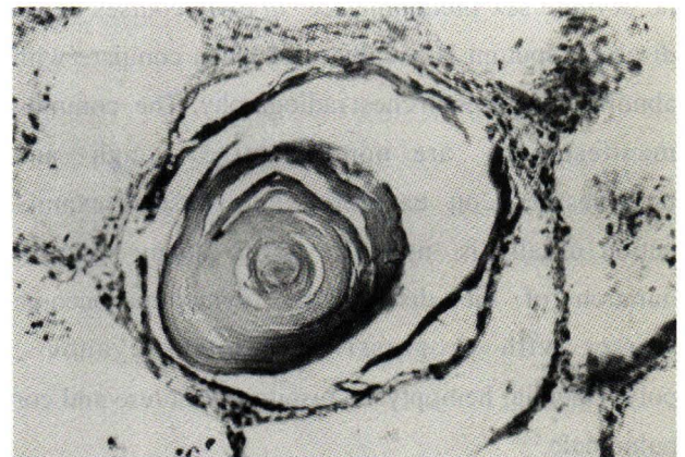
Figure 2. Lung biopsy showing laminated calcospherites within alveolar spaces and slight fibrosis of alveolar wall.

and slight fibrosis of the alveolar wall (Fig. 2). PAM was diagnosed. She was treated with corticosteroid; there was little subjectively observed improvement. One year later, she developed cor pulmonale and thereafter was lost to follow up.